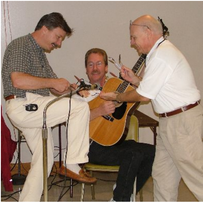
Hee-Haw Want-a-bees "Spoons" come to OLOL at the Family dinner