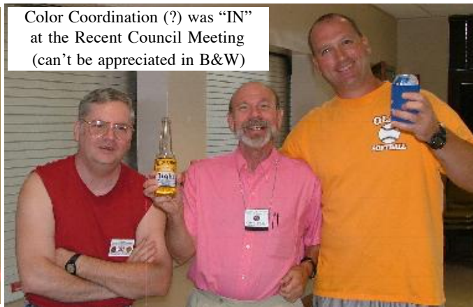
Color Coordination (?) was "IN" at the Recent Council Meeting (can't be appreciated in B&W)