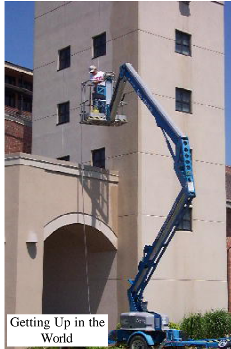
Getting Up in the World

Coincidence is when God chooses to remain anonymous.