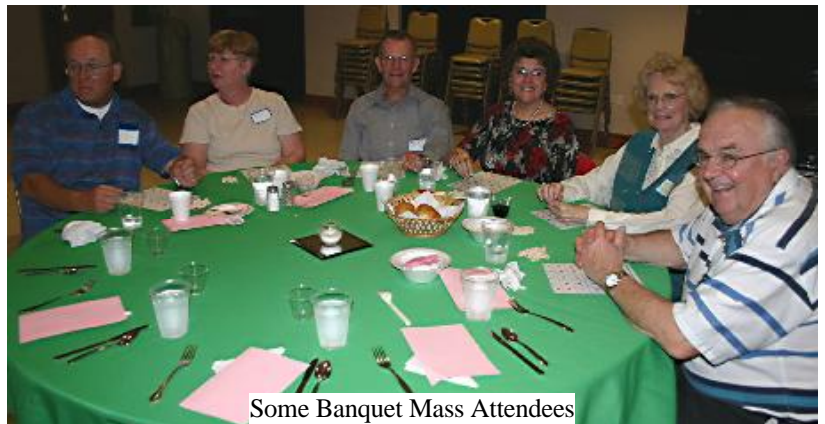
Some Banquet Mass Attendees