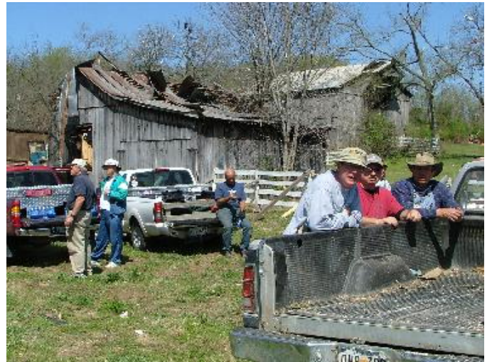
Taking a Break