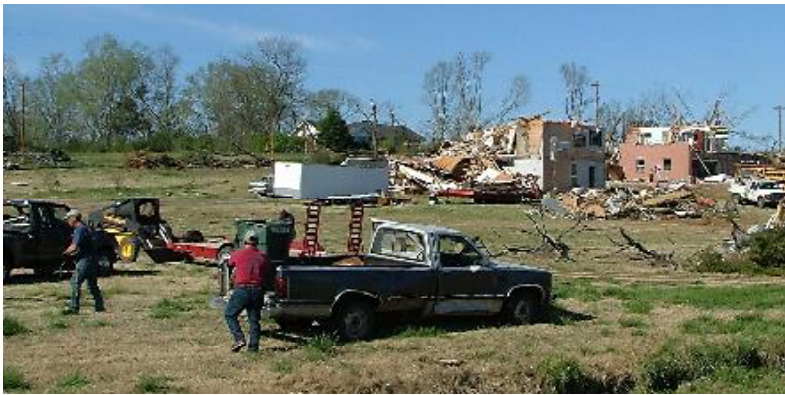
Salvage & Cleanup